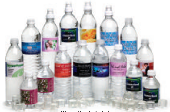
Water Bottle Labels

The LX810 prints onto many different label and tag materials, including inkjet coated high-gloss, semi-gloss and matte labels. Labels printed on high-gloss material are highly scratch- and smudge-resistant and virtually waterproof. This is a perfect solution for primary or box labels that can be exposed to water, rain and snow.