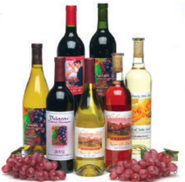
Wine Bottle Labels

The LX810 produces gorgeous, professional-quality labels for all your short-run, specialty products. It is also perfect for a host of other uses such as proofing before going to press on longer runs. Test marketing. Contract manufacturing. Private label goods. Promotional labels. Full-color box-end labels with all the required bar codes. And much more.